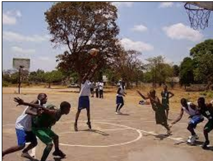
Basketball game in the Central African Republic

Africa – Abidjan Abuja Accra Ain Beida Apapa Eleko Awasa Bamako Benin City Cairo Dakar Djougou Durban Harare Ibadan Ikeja Kampala Lagos Lomé Monrovia Nairobi Port Harcourt